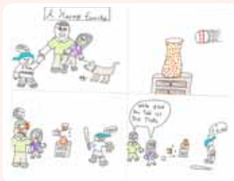
中一冠軍 1B TAMANG PEMBA DORJEE 作品 S.1 winner's entry - 1B Tamang Pemba Dorjee