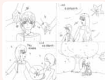
中三冠軍 3C 余安安安宜 作品 S.3 winner's entry - 3C Yu Twins